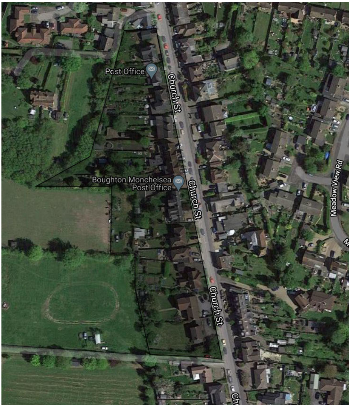
Church Street West