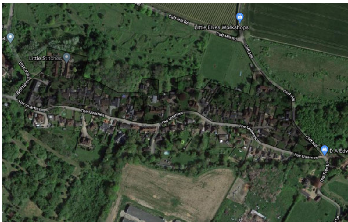
The Quarries North

A number of areas of housing of different ages and styles across the parish, both existing and proposed, were identified. These are shown in the maps below. Two areas, Langley Park and the corner of Heath Road and Church Street, were identified from planning applications as set out in the table below.