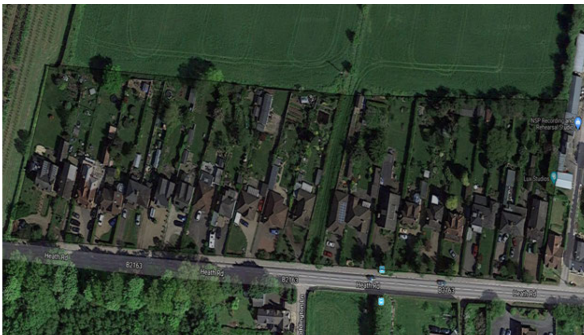
Heath Road North