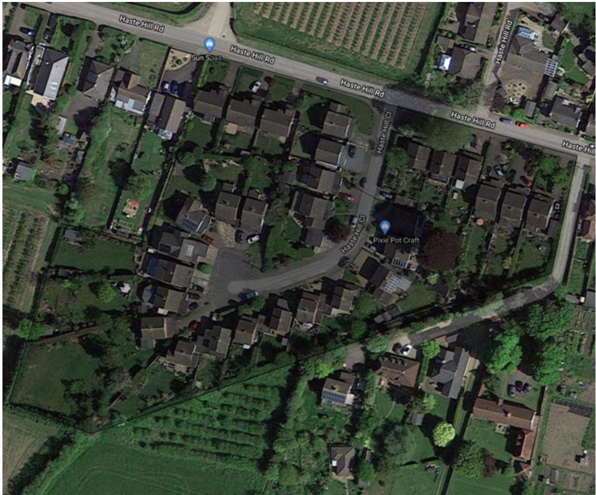
Haste Hill Road