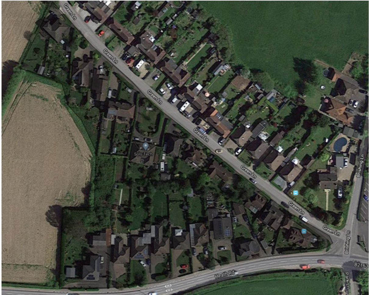
Green Lane South

Green Lane South https://drive.google.com/open?id=1e-FGyUo_hNtketQtYiNiOG2n53eIUzWr&usp=sharing