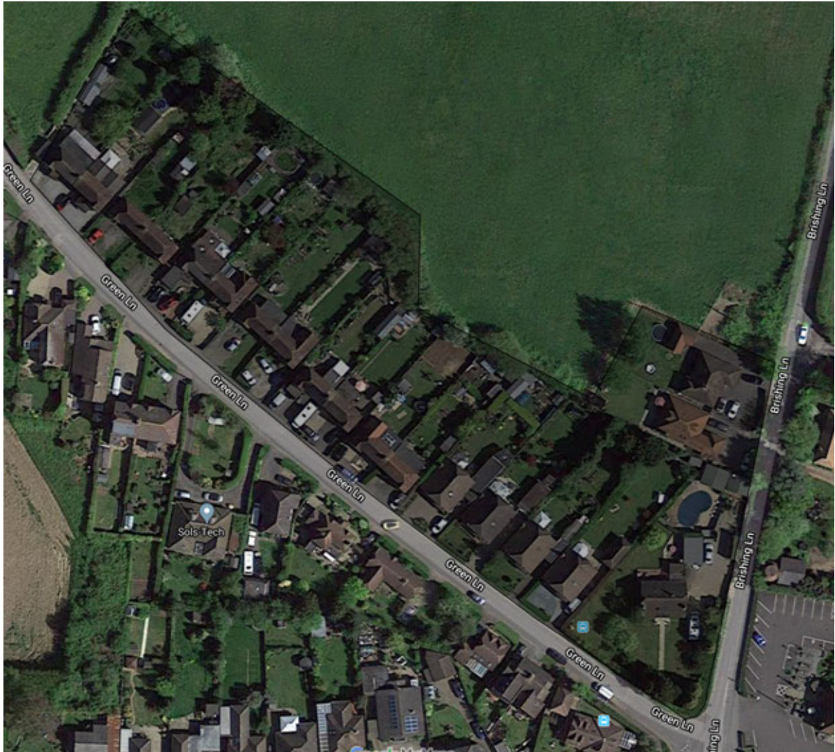
Green Lane North