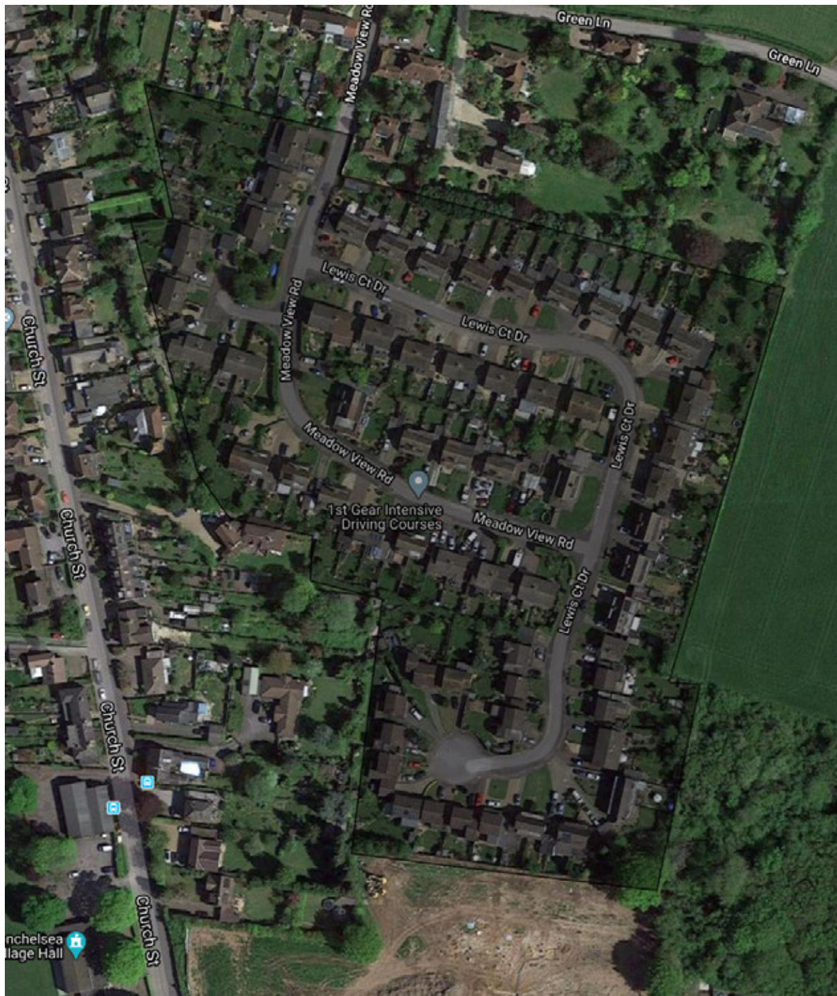
Lewis Court Drive Estate